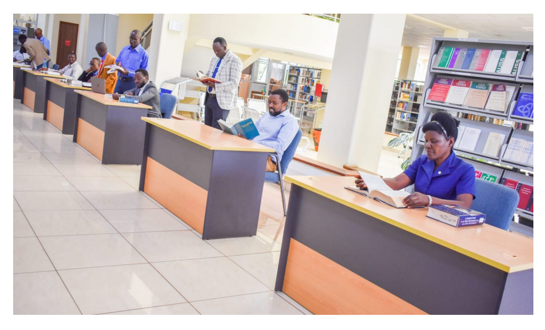
Reading area of the Library